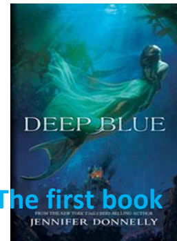
The first book

The Waterfire Saga by Jennifer Donnelly is an adventure story but it has lots of tragedies in it.