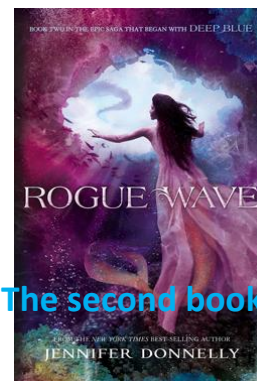
The second book

Personally I think it is a fantastic story since it is a mixture of drama, fantasy and adventure plus you get into all the scenes pretty quickly ,also you get all these feelings streaming out of you, like when the character is sad you start to cry and you always cheer them on somehow !